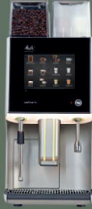
MELITTA® CAFINA® XT6