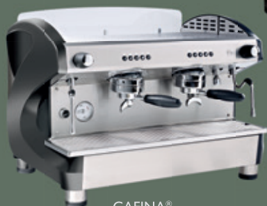
CAFINA® VIVA 2