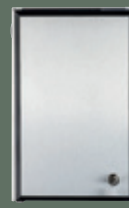
MC 5 L