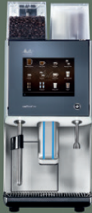
MELITTA® CAFINA® XT5