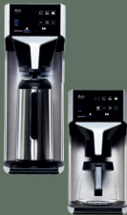
MELITTA® CAFINA® XT180