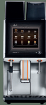
MELITTA® CAFINA® XT7