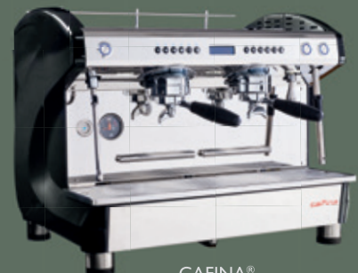
CAFINA® LIFE HIGH CUP 2