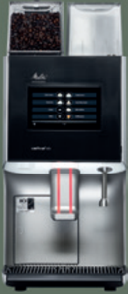
MELITTA® CAFINA® XT4