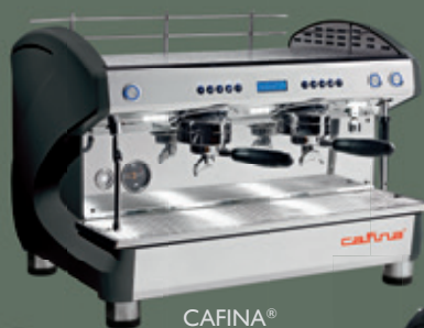
CAFINA® LIFE 2