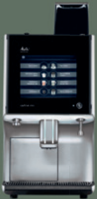
MELITTA® CAFINA® XT8-F