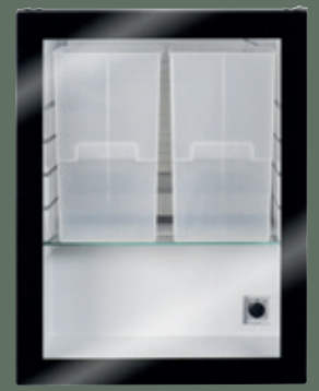
MC UT 20 L