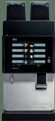
MELITTA® CAFINA® CT8-F