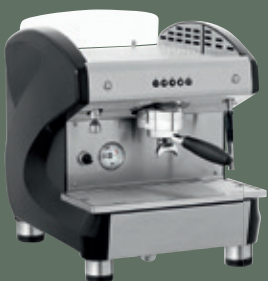
CAFINA® VIVA 1