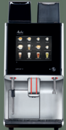
MELITTA® CAFINA® XT8