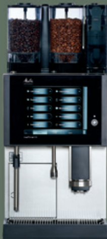
MELITTA® CAFINA® CT8