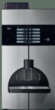
MELITTA® cup III